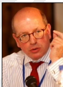
James Sherr Head of the Russia and Eurasia Programme at the Royal Institute of International Affairs (Chatham House) in London

policy advisor. As an alumnus of the NATO Defense College in Rome, he specialized in arms control and security policy. Ambassador Hennig's last assignment before joining the EastWest Institute was as "Commissioner for Civilian Crisis Prevention, Conflict Resolution and Post Conflict Peace Building" for the German Federal Foreign Office in Berlin. He has published on subjects such as arms control, the OSCE and conflict prevention.